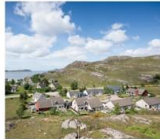
Mixed affordable tenure homes