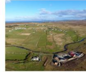
Homes & NHS health centre