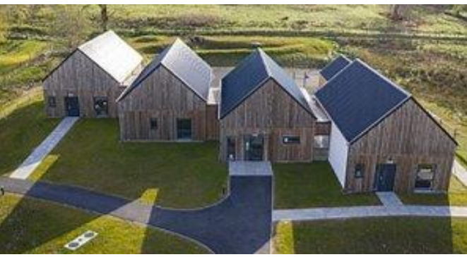
Strontian Community School Ltd.