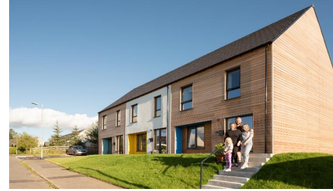
NVLT Passivhaus, Closeburn