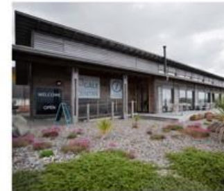
Tourist Hub (Passivhaus)