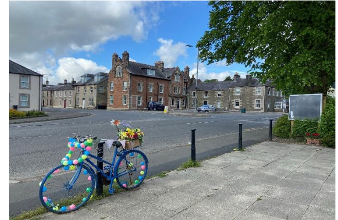
Old Police Station, Langholm