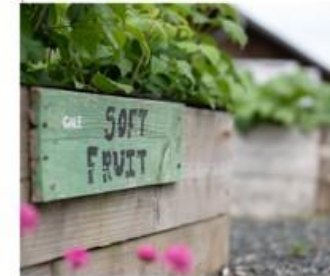
Community growing spaces