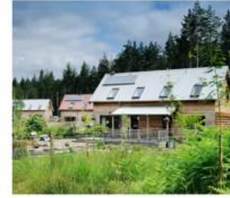
Low-cost home ownership