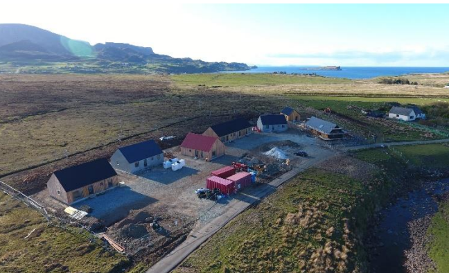
Staffin, NHS health centre