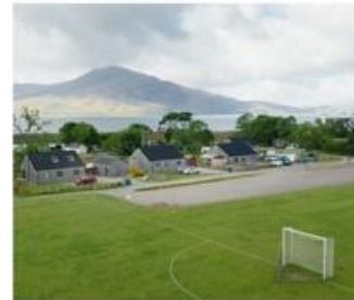
Rent To Buy homes & shinty pitch