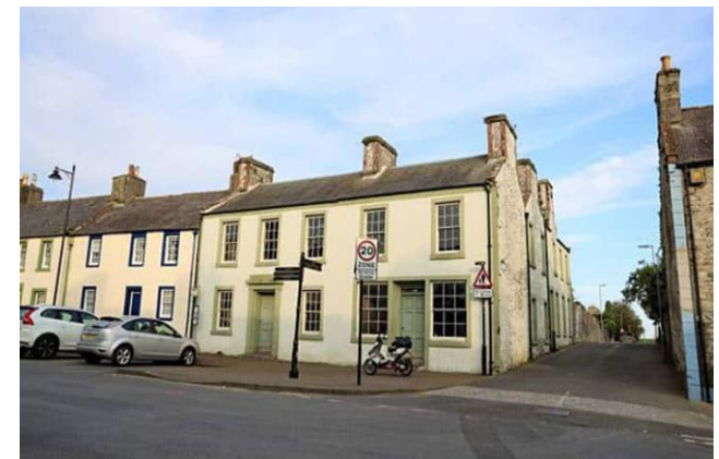
Former Hotel and New Town Hall, Whithorn