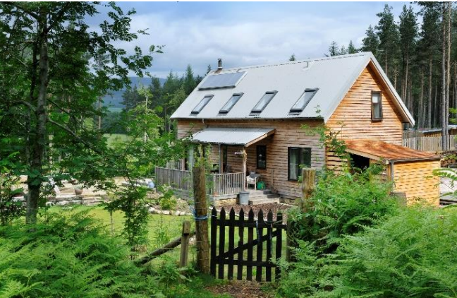
Cairngorms, low-cost home ownership

We pioneer a range of housing tenures, financial and technical solutions to create sustainable futures for rural communities – including initiatives such as Long Lease, Empty Homes and Woodland Crofts